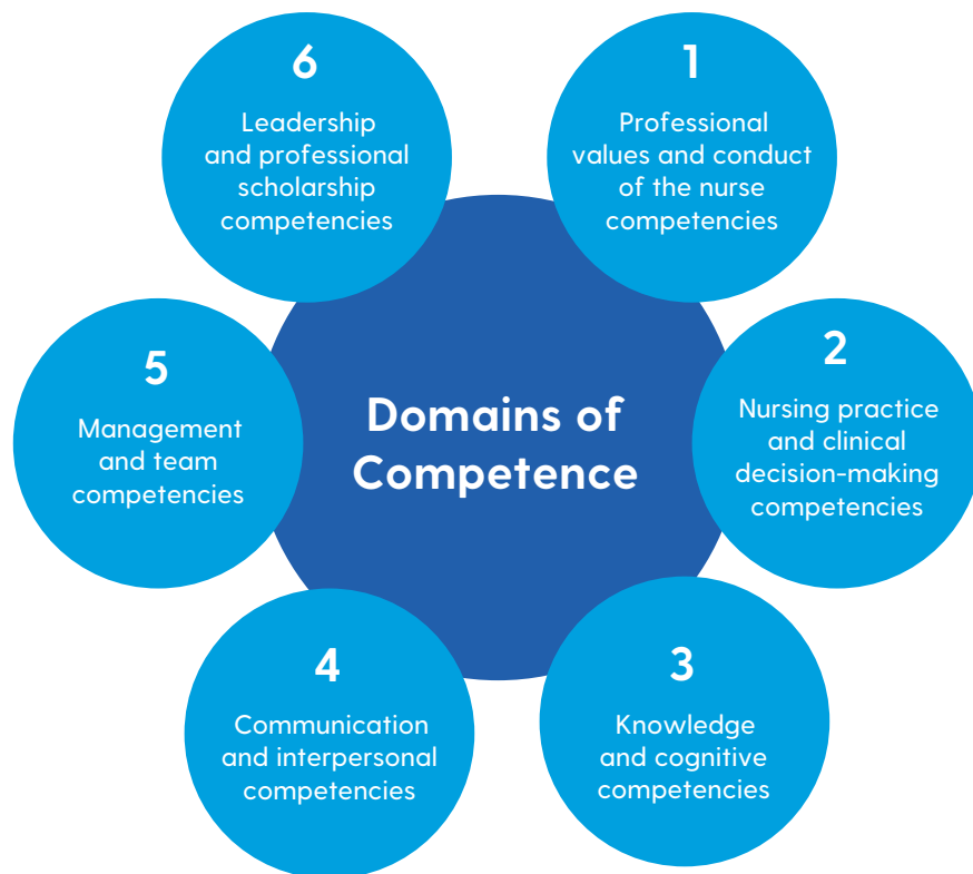
Figure 1 - Domains of Competence (NMBI, 2019)